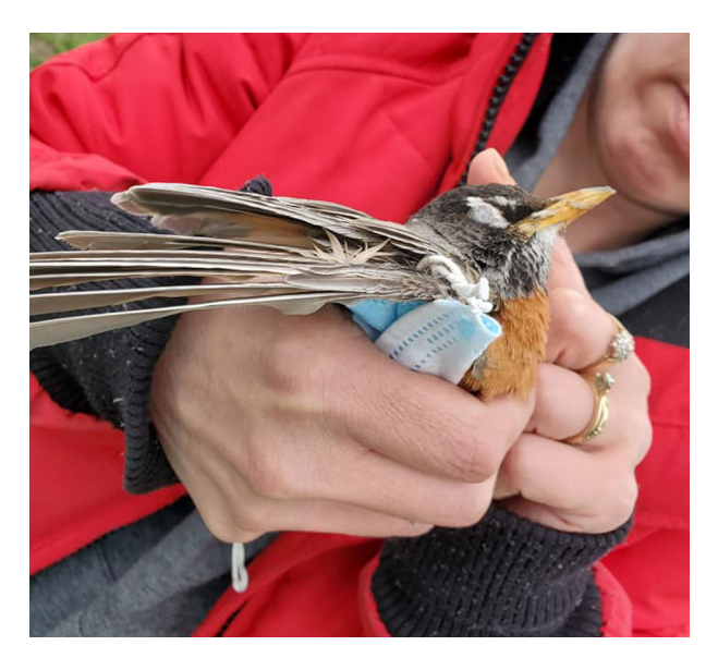
Figure 4. First victim of COVID-19 litter, an American robin ( Turdus migratorius ) entangled in a face mask at Chilliwack, BC, Canada on the 10th of April 2020.

Our observations may have been the first Dutch cases, yet the first reported victim of COVID-19 litter globally, to our knowledge, was an American robin ( Turdus migratorius ; Denisuk, 2020). This bird appears to have died after becoming entangled in a face mask at Chilliwack, BC, Canada, on the 10th of April 2020 (pers. comm. Sandra Denisuk; fig. 4). After that, a young gull ( Larus sp.) was found walking with a face mask tangled around its legs in Chelmsford, Essex, UK (RSPCA Essex South, 2020). It had struggled with the mask for two weeks and its limbs and