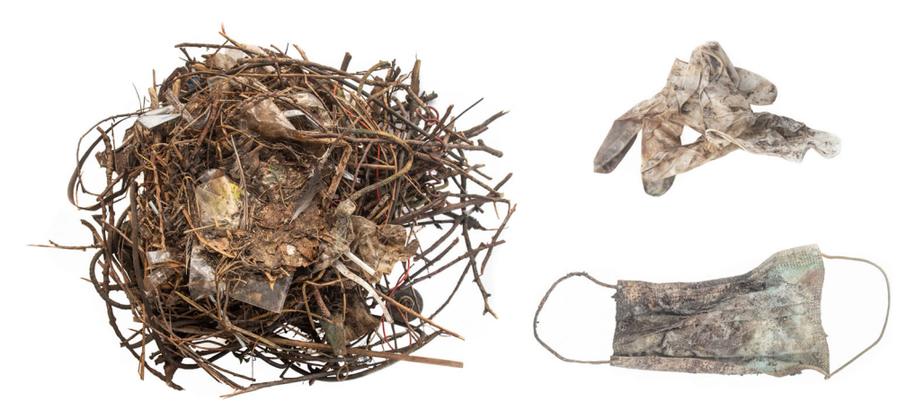
Figure 3. Nest of common coot ( Fulica atra ) partly built with face mask (GW9792-3) and glove (GW9792-4). Nest located at the Beestenmarkt, Leiden, The Netherlands, collected on the 6th of September 2020.

Our observations may have been the first Dutch cases, yet the first reported victim of COVID-19 litter globally, to our knowledge, was an American robin ( Turdus migratorius ; Denisuk, 2020). This bird appears to have died after becoming entangled in a face mask at Chilliwack, BC, Canada, on the 10th of April 2020 (pers. comm. Sandra Denisuk; fig. 4). After that, a young gull ( Larus sp.) was found walking with a face mask tangled around its legs in Chelmsford, Essex, UK (RSPCA Essex South, 2020). It had struggled with the mask for two weeks and its limbs and