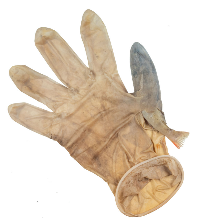
Figure 2. An entrapped perch ( Perca fluviatilis ) in a PPE glove (GW9899-1E), found during a Plastic Spotter clean-up in the canals of Leiden, The Netherlands.

that plastic litter also impacts the lesser-studied freshwater ecosystems and that the new wave of PPE latex gloves littering our environment could make entrapments like these more frequent in the future.